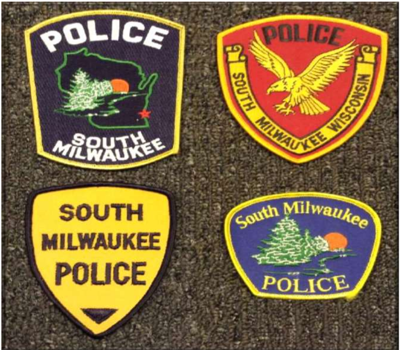
South Milwaukee Police Patches Through the Years