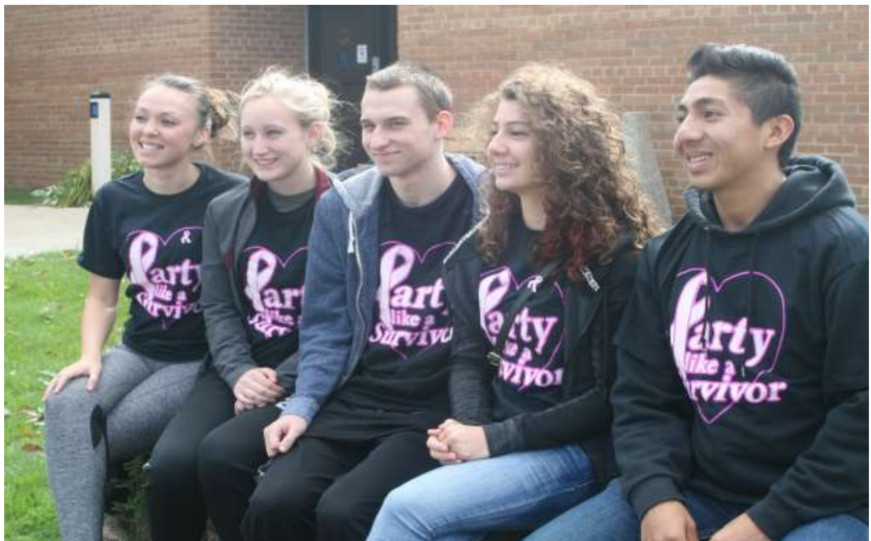
South Milwaukee High School Advance Marketing Students