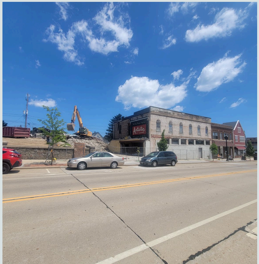
2025 Demolish 1210 Milwaukee

10-foot elevation change alley to Milwaukee Ave